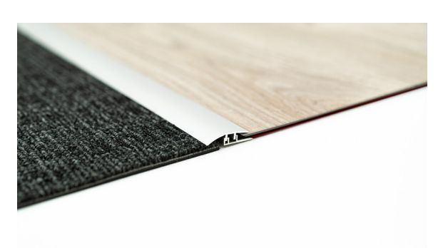
For specific installation instructions on Xtrafloor® see https://www.installandclean.com/en/evfwithpaduniclic